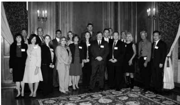
Cohort 1 doctoral students, doctoral program faculty, and School of Education Dean and faculty at the program launch reception in Fall 2010.

Most doctoral students in Cohort 1 are about ready to move into the dissertation proposal development phase. In preparing for dissertation supervision, the Doctoral Core Faculty conducted one workshop in Spring 2011 to help the SOE faculty understand the roles and responsibilities of being a dissertation committee chair and/or member. Two more workshops are forthcoming.