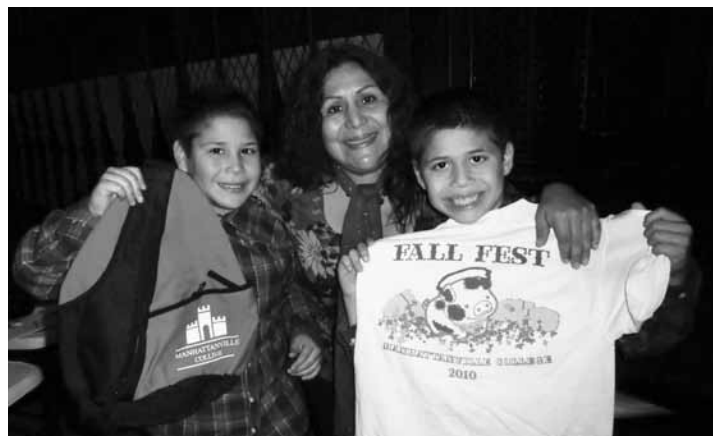
Two of the panelists with their Mom with gifts from Manhattanville