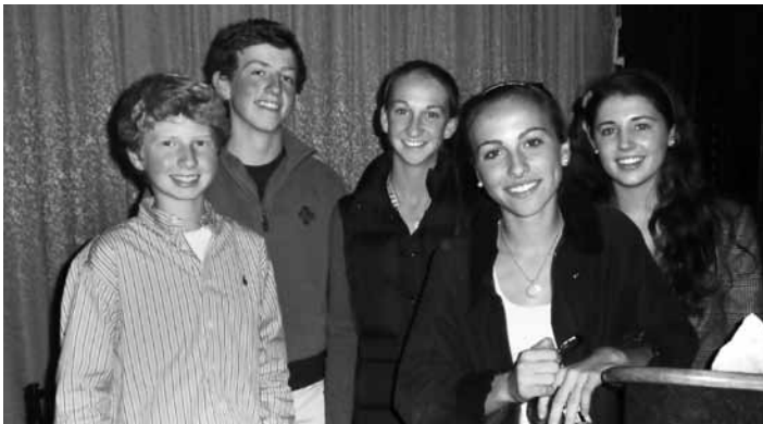
High school student panelists from Bronxville High School