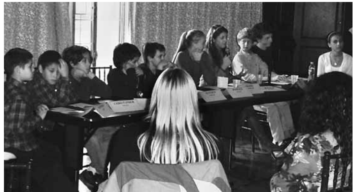
The Elementary student panelists from Church Street School