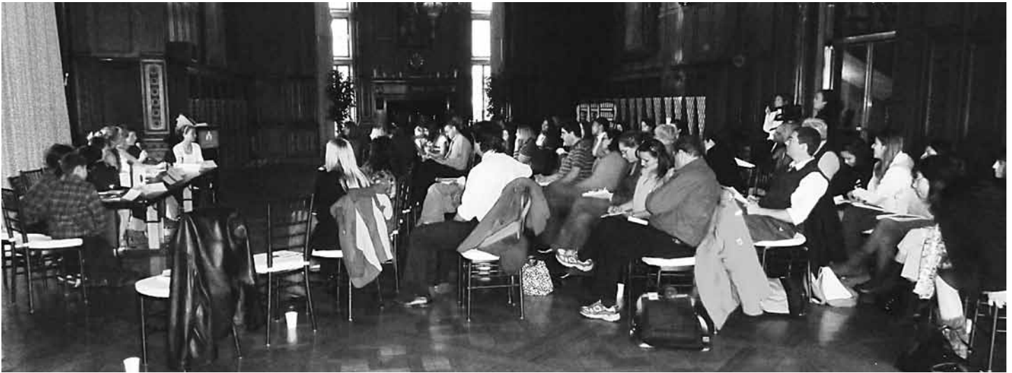
The student panel program drew a large audience of alumni and teacher candidates

The audience of current teachers and potential candidates found it extremely valuable to hear from students themselves on how they felt about their teachers' qualities.